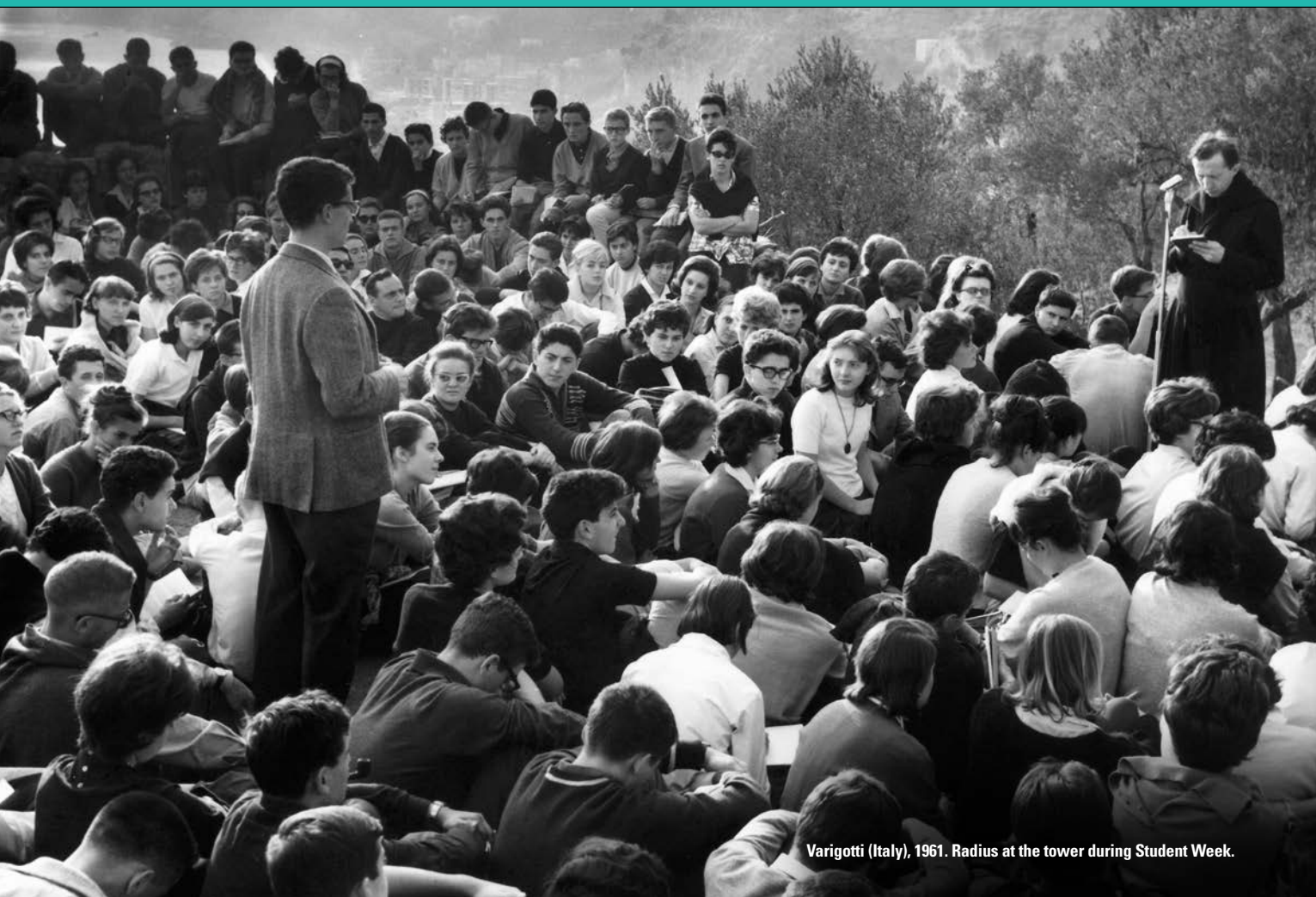
Varigotti (Italy), 1961. Radius at the tower during Student Week.

because you have been called to this road. You will love your wife better, you will love your friends better, you will love your children better, you will know what it means to be merciful, you will know what it means to forgive, you will know what it means to sacrifice yourself to build so that others can be better off, you will know what it means to be human, you will be more human. ‘Those who follow Me will have eternal life,’ which is Him, the relationship with Him” (L. Giussani, In cammino [On the Road] 1992-1998 , Bur, Milan, 2014, pp. 226-27). Fr. Giussani never changes a jot! Eternal life is Christ. Salvation is Him. Only by remaining bound to Him on this road can we see our relationships blossom, can we build, can we be open to the needy, can we be ever more human.